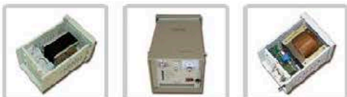
Similar products (from L to R): FYGD-C, FYGD-MS-C, FYGD-E.

* This feature is only available on certain models.